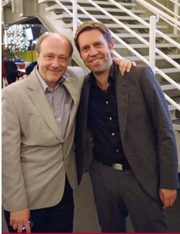
Marc-André Hamelin and Leif Ove Andsnes both served on the jury in 2012