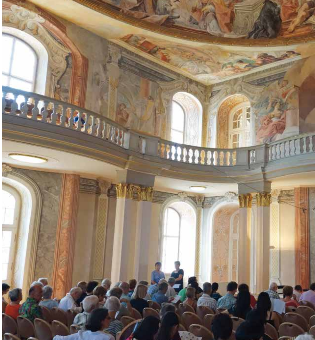
A view from the balcony in the Asam Hall.

These events were mostly open for musicians up to around 30 years old. After a while, competitions were also established that focus specifically on the much younger age groups. The prizes were not as high as those in the major competitions, but the main purpose was to offer the youngsters an international platform: to give them an exciting event, for which they need to prepare and can compare with others to see where they stand. Apart from this, it is wonderful to meet people from various countries and different cultural backgrounds, and to make friendships which are so much needed in life, especially when you are trying to make a living as a pianist.