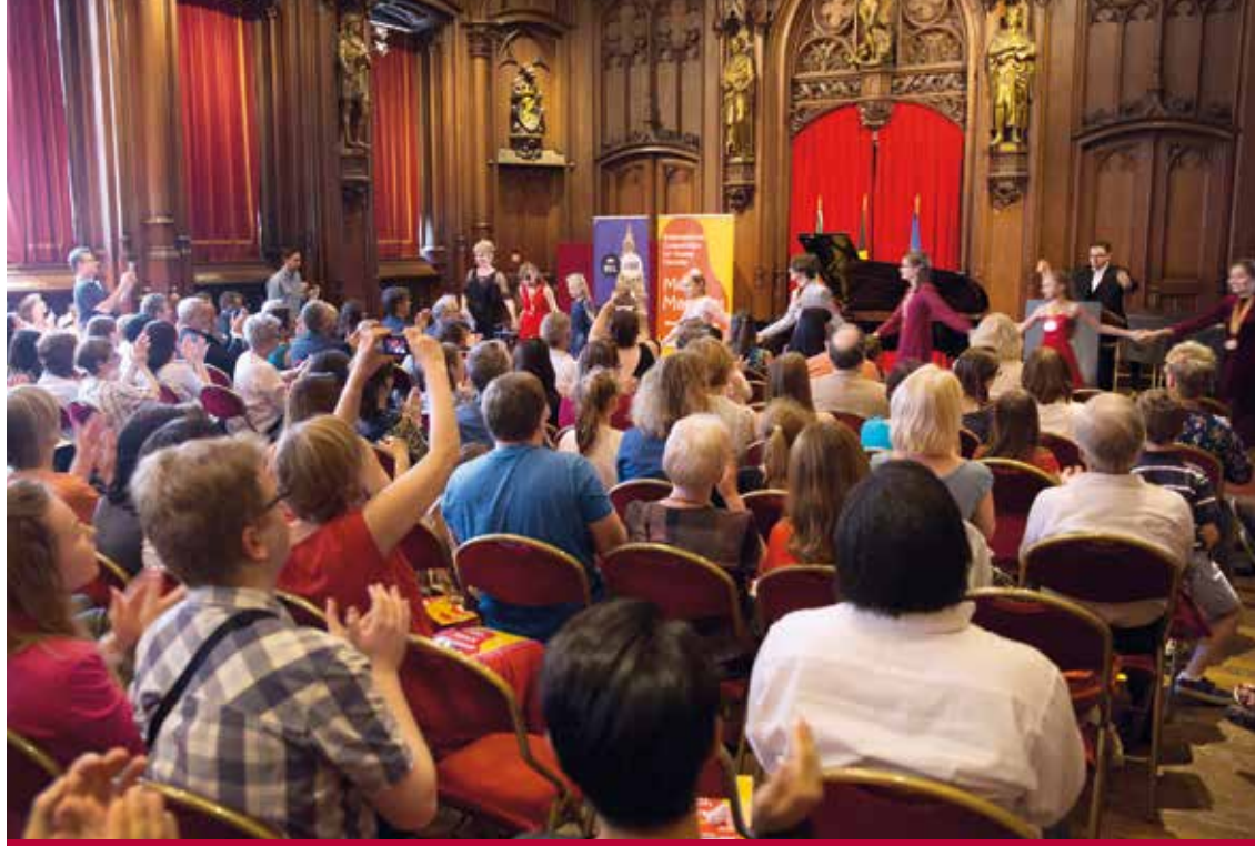
Final in the Hotel de Ville in Brussels