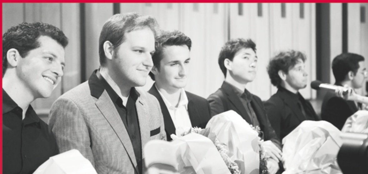
LAUREATES PIANO 2016