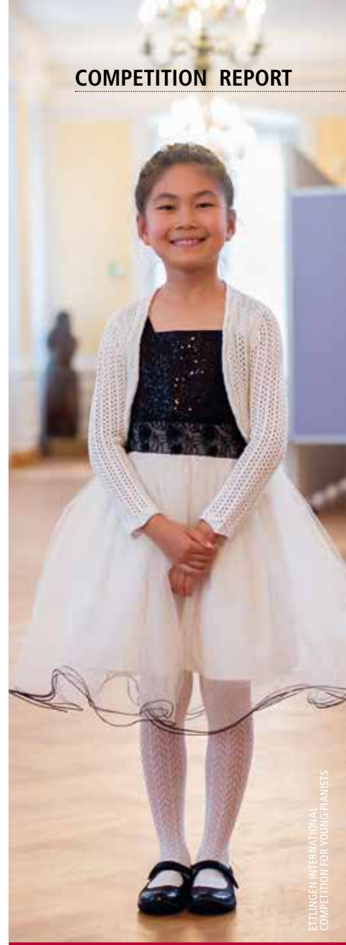
ETTINGEN INTERNATIONAL COMPETITION FOR YOUNG PIANISTS