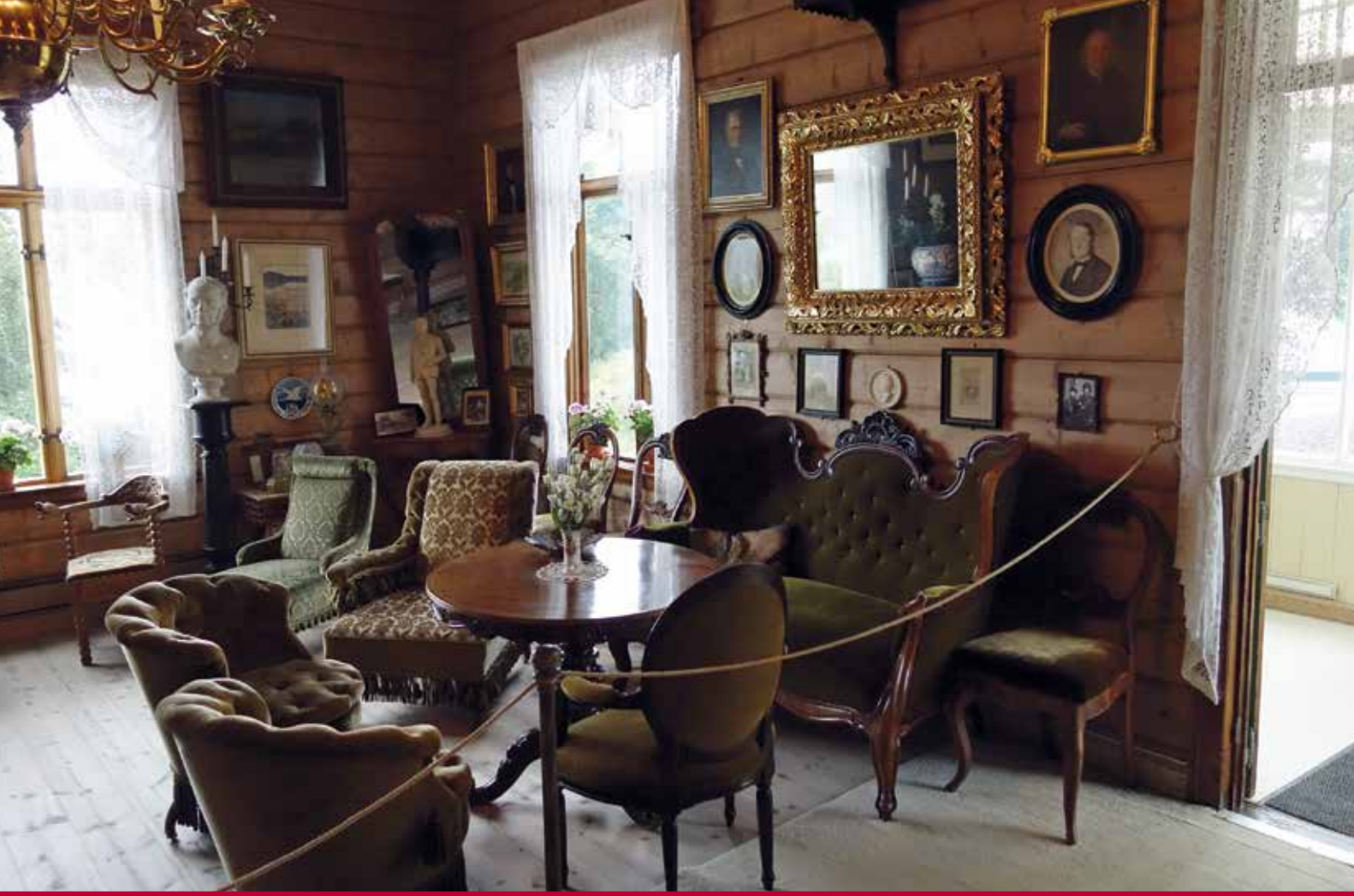
A view in one of the rooms of Edvard Grieg's home