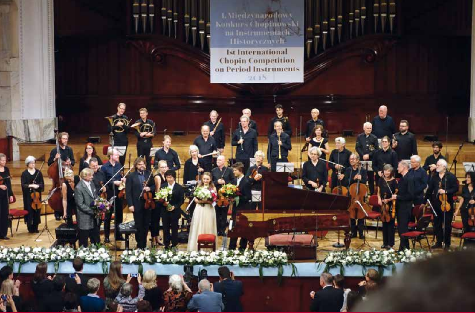
Three of the six finalists on stage after their performances on the 2 nd day of the finals