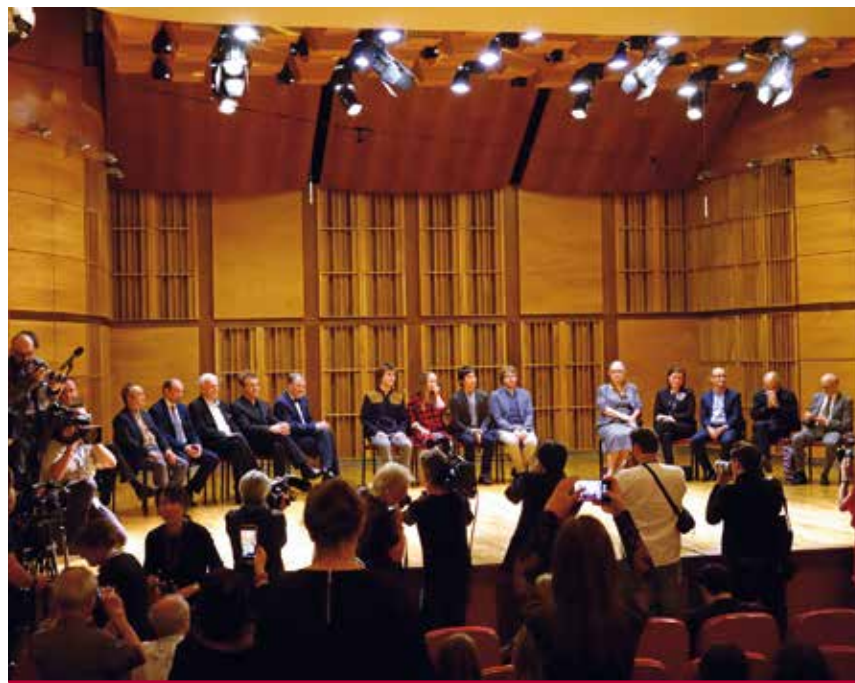
Everybody is awaiting the results. The four prize winners are seated between the 10 jury members.